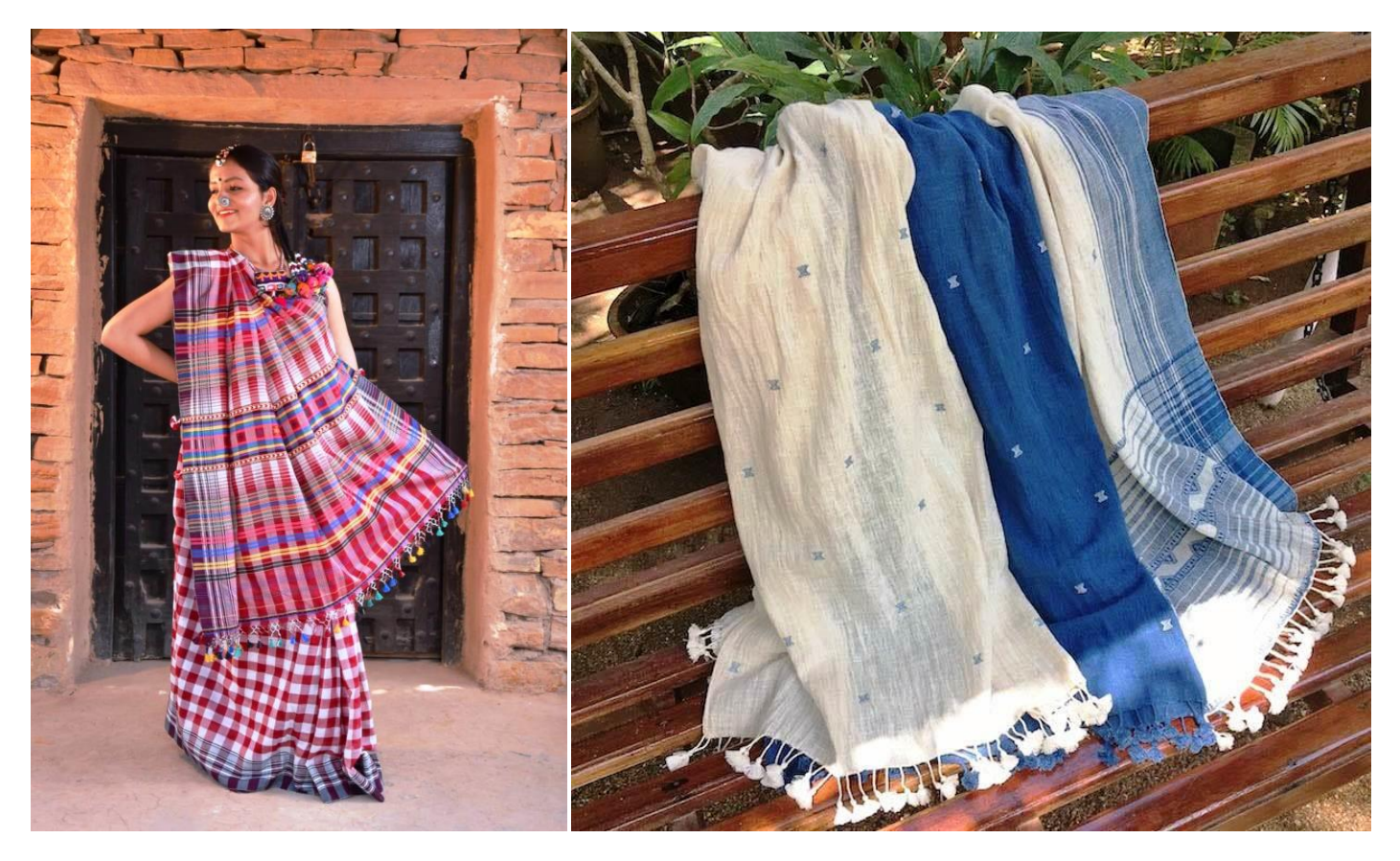
Kutch (Bhujodi) Cotton Saree