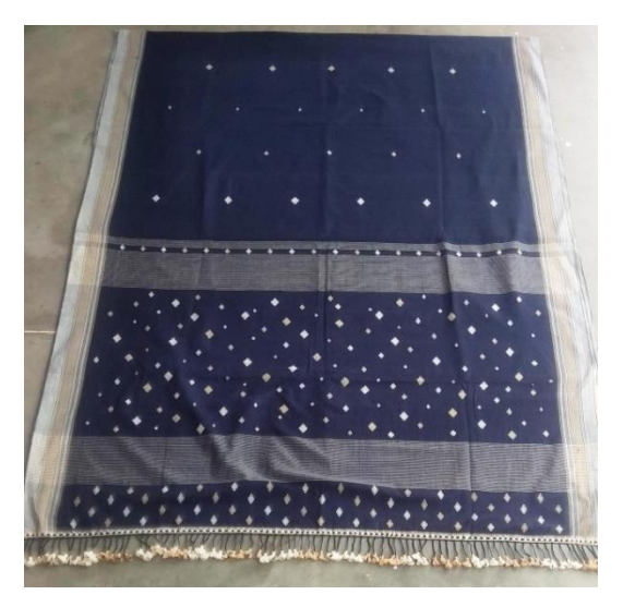
Kutch (Bhujodi) Cotton-Silk Saree.